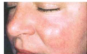
Broken Capillaries — After 2 IPL treatments